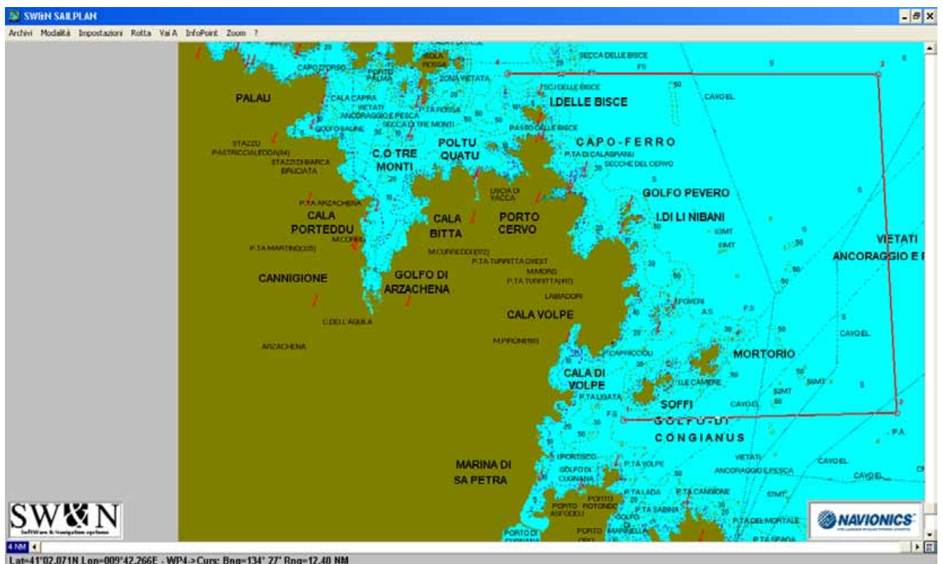
Chart Sailing Area

Percorso: P – 1 – 2 - Gate 3P/3S – 1 – 2 – A